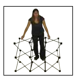
Remove frame (Q) from case. Standing in front or behind the frame (Q) pull up from the middle of the frame until it expands and extends out fully.